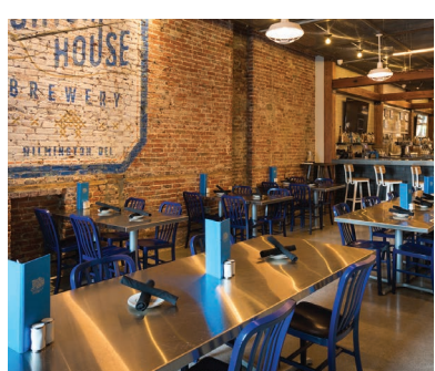
STITCH HOUSE BREWERY AT 827 MARKET ST WILMINGTON, DE / 5,000 SF