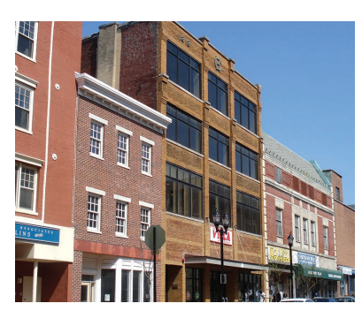
605 N. MARKET ST. WILMINGTON, DE / 13,500 SF