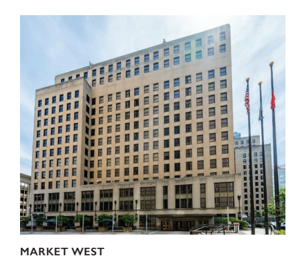
WILMINGTON, DE / 460,000 SF