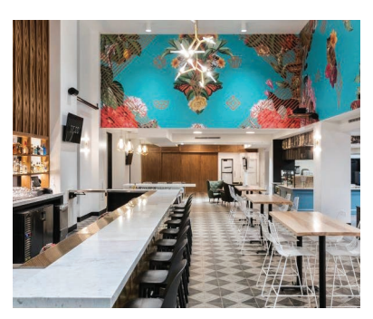
DE.CO AT THE DUPONT BUILDING WILMINGTON, DE / 12,000 SF