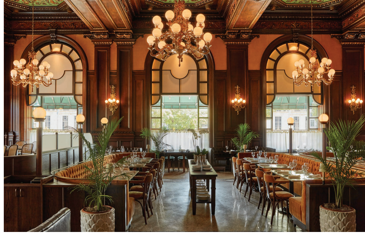
LE CAVALIER AT THE GREEN ROOM WILMINGTON, DE / 2,500 SF