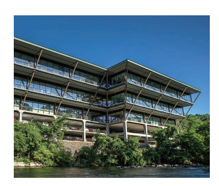
THREE MILL ROAD WILMINGTON, DE / 54,961 SF