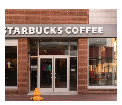
STARBUCKS AT 629 MARKET ST WILMINGTON, DE / 2,500 SF