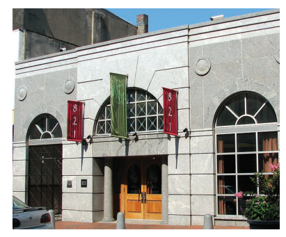
CHELSEA TAVERN AT 821 MARKET ST WILMINGTON, DE / 8,260 SF