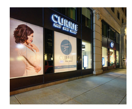
CURRIE AT THE DUPONT BUILDING WILMINGTON, DE / 4,521 SF