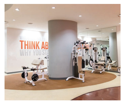
CORETEN FITNESS AT MARKET WEST WILMINGTON, DE / 7,400 SF