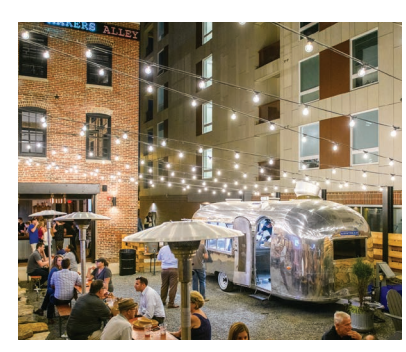
MAKER'S ALLEY AT 801 N ORANGE ST WILMINGTON, DE / 4,965 SF