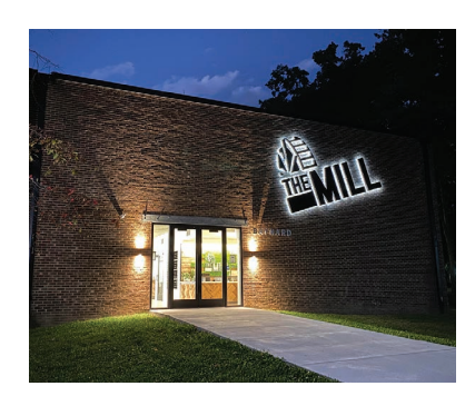
THE MILL AT THE CONCORD WILMINGTON, DE / 30,000 SF