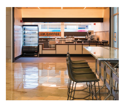
I.M. COFFEE AT I.M. PEI BUILDING