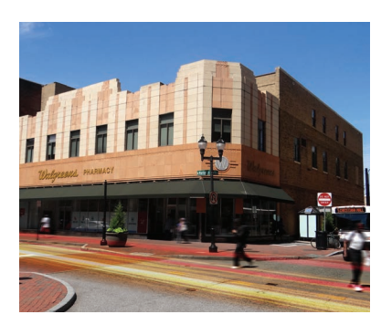
WALGREENS AT 839 MARKET ST WILMINGTON, DE / 24,000 SF