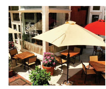
LA FIA AT 421 MARKET ST WILMINGTON, DE / 1,996 SF