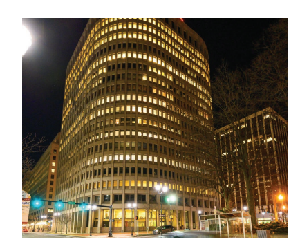
1000 N WEST WILMINGTON, DE / 411,271 SF