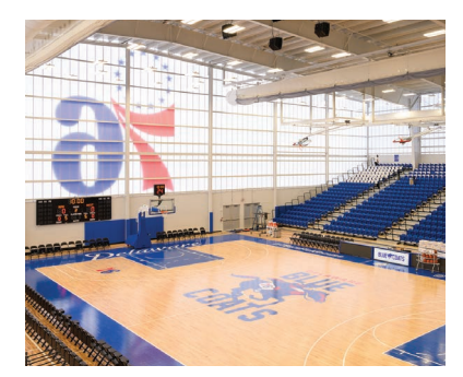
CHASE FIELDHOUSE WILMINGTON, DE 161,000 SF, 2,500 SEAT SPORTS COMPLEX