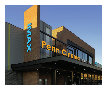
PENN CINEMA & IMAX THEATER AT WILMINGTON RIVERFRONT WILMINGTON, DE / 3,218 SEATS