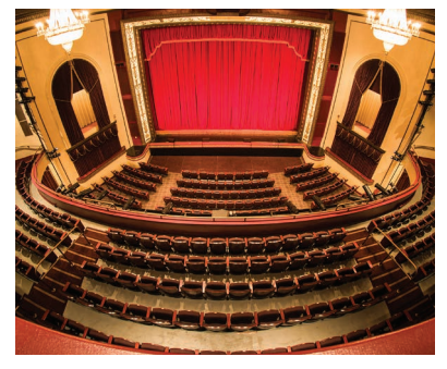
THE PLAYHOUSE ON RODNEY SQUARE WILMINGTON, DE / 1,252 SEATS