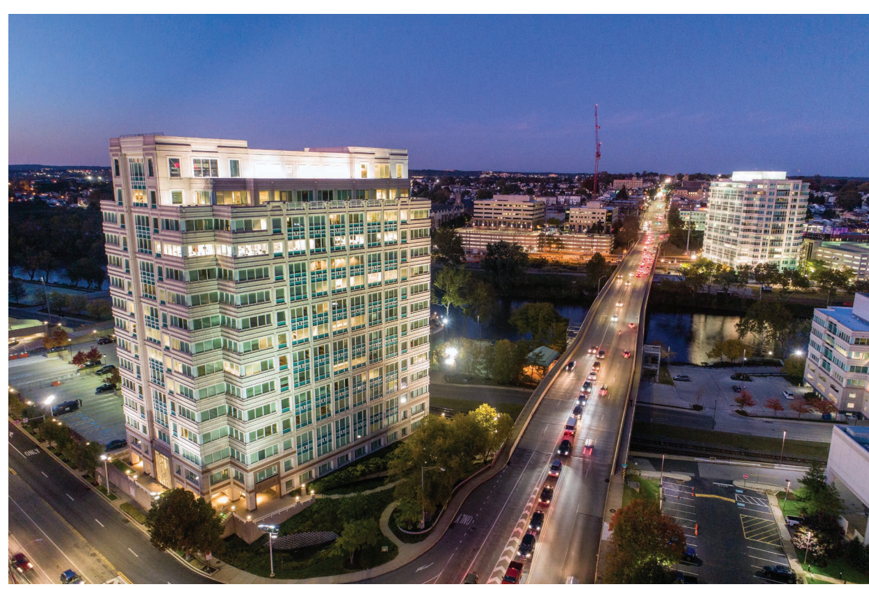
ONE TOWER BRIDGE CONSHOHOCKEN, PA / 271,000 SF