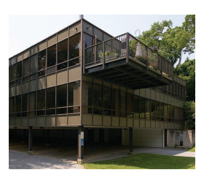
TWO MILL ROAD WILMINGTON, DE / 31,963 SF