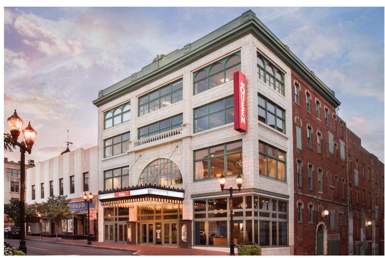
THE QUEEN THEATRE 500 N. MARKET STREET WILMINGTON, DE / 1,279 SEATS