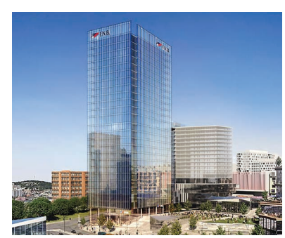
FNB FINANCIAL CENTER IN DEVELOPMENT PITTSBURGH, PA / 425,000 SF