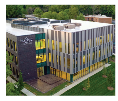
MARLETTE FUNDING CLASS A OFFICE WILMINGTON, DE / 60,000 SF