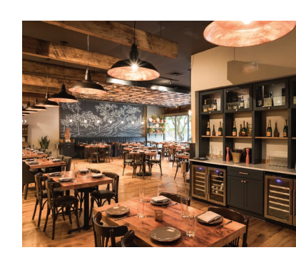
BARDEA AT 620 MARKET ST WILMINGTON, DE / 4,500 SF