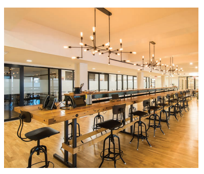
THE MILL AT MARKET WEST WILMINGTON, DE / 12,000 SF