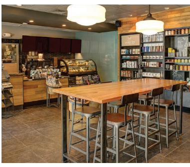
STARBUCKS AT MARKET WEST WILMINGTON, DE / 2,248 SF