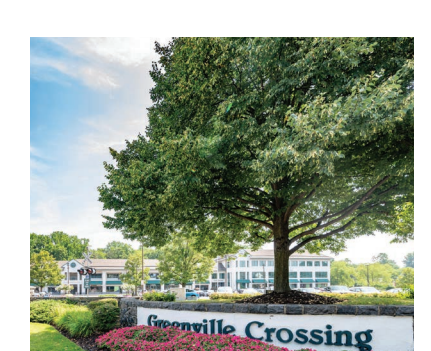
GREENVILLE CROSSING GREENVILLE, DE, ONE GREENVILLE CROSSING: 63,012 SF TWO GREENVILLE CROSSING: 66,177 SF