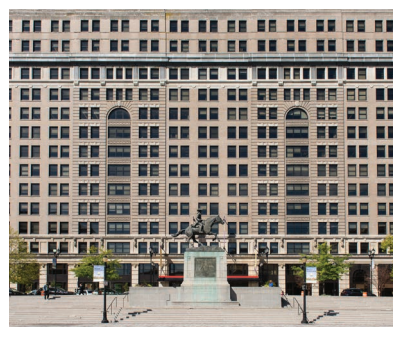
CHEMOURS BUILDING WILMINGTON, DE / 316,000 SF OFFICE